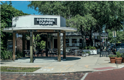
ABOVE:Hannibal Square BELOW: Mount Moriah Church in the African-American district of Winter Park. LEFT: Mount Moriah Missionary Baptist Church in the early 20th century.

community with virtually no control and only one tenth the governing power of whites. As to the validity of the complaint, certainly the Winter Park commission should be more diverse. No doubt. But no one expects Eatonville to elect a white commission member, mainly as a result of the town's demographics. The same is true with Winter Park. Yes, the west side of Winter Park is a "black district," however, the makeup of this area has changed rapidly over the decades and many African-Americans have moved away. Regardless of statistics, people should decide their vote on the content of one's character and not the color of their skin.