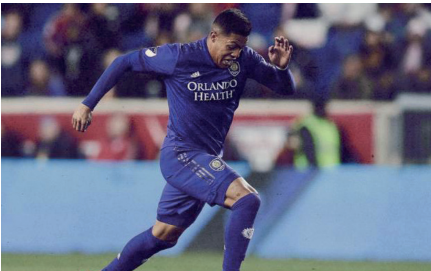
PICTURED: Members of the Orlando City Soccer Team Celebrating a recent win. Games will begin again soon at Exploria.