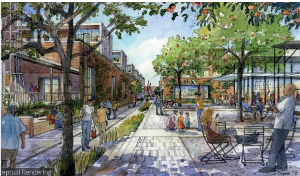
ABOVE: Artistic rendition of the Packing District. BOTTOM RIGHT: A historic photo of the Packing District in the hey-day of Orange farming in Central Florida